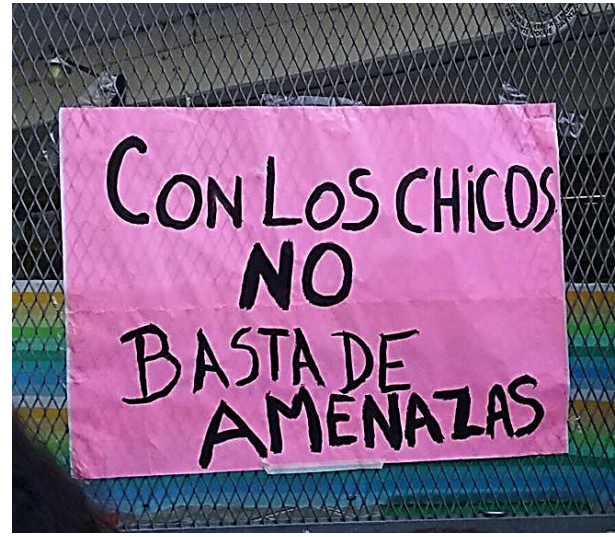
Not Against the kids. Stop threats.